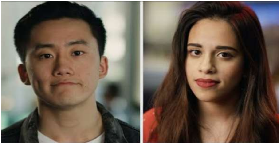
Monash University. (2019, October 21). Sexual Consent [Video]. YouTube.