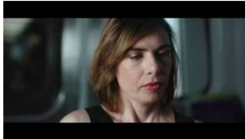
Respect Victoria. (2019, April 4). Respect women: Call it out – active bystander [Video]. YouTube.