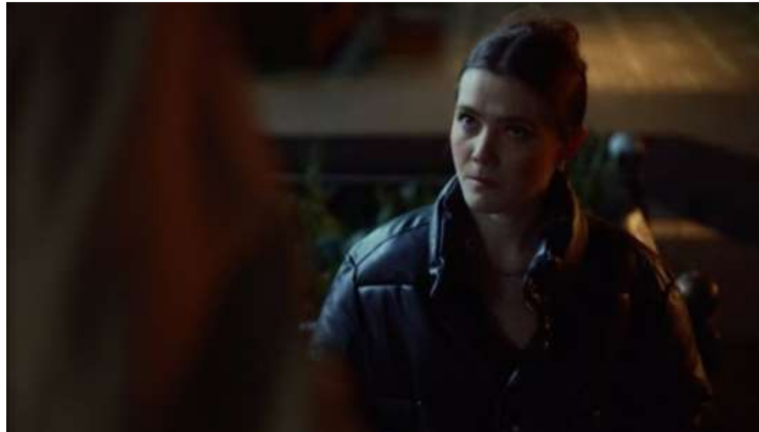
Recognising harassment/inappropriate conduct [Video]. YouTube.

Consider what support or reporting options may be available at SCI.